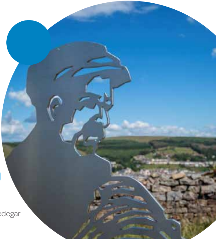
Aneurin Bevan Stones, Tredegar

In Wales the Welsh Government have set an ambitious target to achieve a 30% reduction in carbon emissions by 2030. We aim to meet this target and the opportunities contained within this Prospectus will help us achieve it.