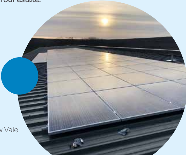
Silent Valley, Ebbw Vale

Although not an immediate project opportunity, inclusion of this project within this prospectus demonstrates the Council's commitment to developing a portfolio of energy projects offering both immediate savings and long term investment in our estate.