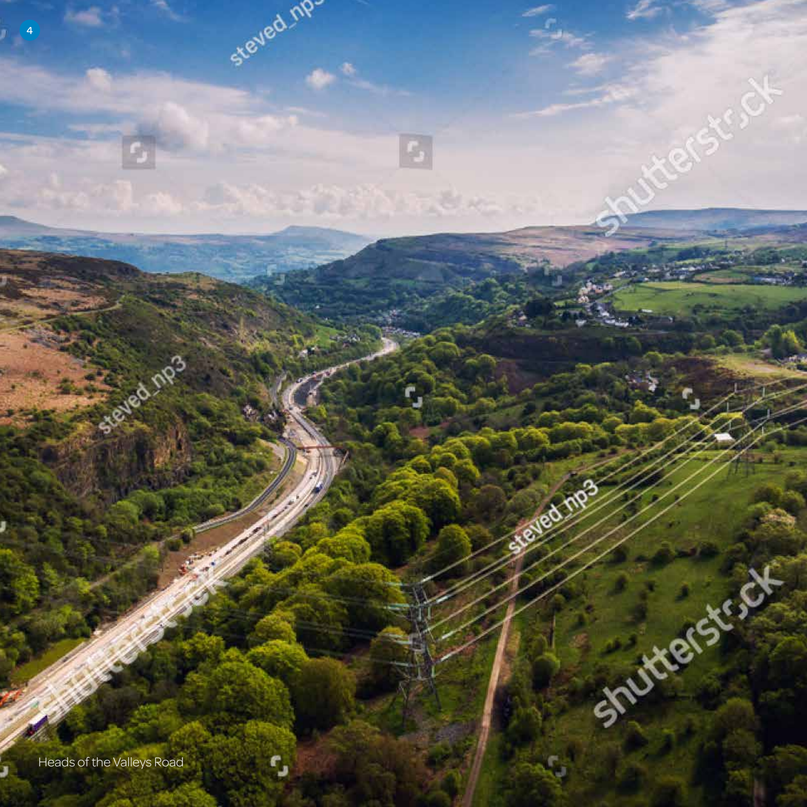
Heads of the Valleys Road